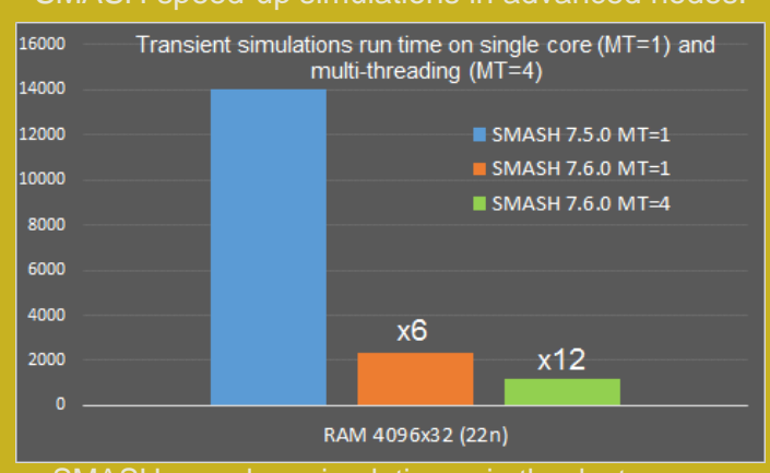
SMASH speed-up simulation gain thanks to new NICSLU solver and RC reduction method, with 335k capacitors, 32k MOS and 210k resistors